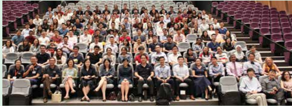
Distinguished guests, participants and the Organising Committee – i.e. everyone able to resist the temptation of the buffet dinner long enough to gather for a group photo