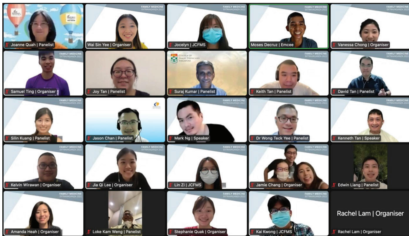
A combined photo of all the panelists, speakers and organizers nearing the end of our event