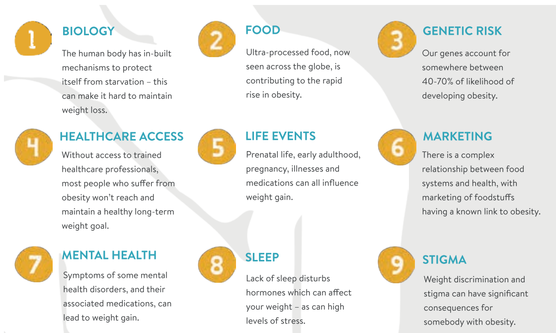
Figure 2. ROOTS of Obesity Fact Sheet. World Obesity Federation 2021 22