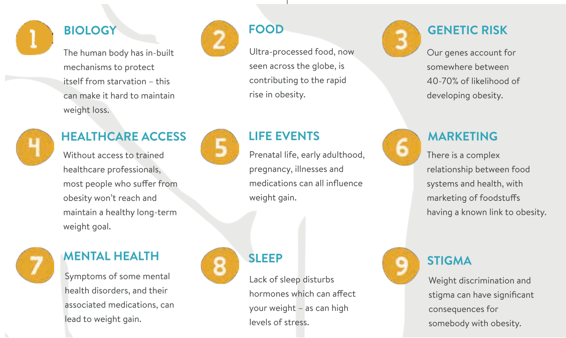
Figure 2. ROOTS of Obesity Fact Sheet. World Obesity Federation 2021 22

harmful ectopic fat deposition in lean tissues such as the heart, liver, pancreas, and kidneys. 23 These two phenomena contribute to a pro-inflammatory and insulin-resistant milieu, giving rise to metabolic complications such as type 2 diabetes mellitus (T2DM), non-alcoholic fatty liver disease (NAFLD), and cardiovascular disease (CVD). 23,24 Additionally, the mechanical forces resulting from excessive adipose tissue can give rise to biomechanical consequences (such as Obstructive Sleep Apnoea (OSA) and low back pain), and obesity as a condition has been associated with various psychosocial issues, impacting on mental health. 25