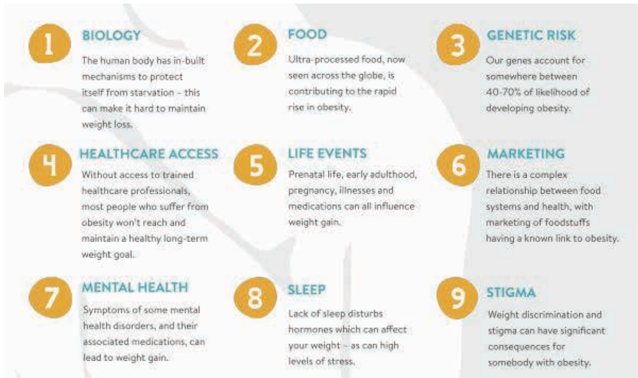
Figure 2. ROOTS of Obesity Fact Sheet. World Obesity Federation 2021 22