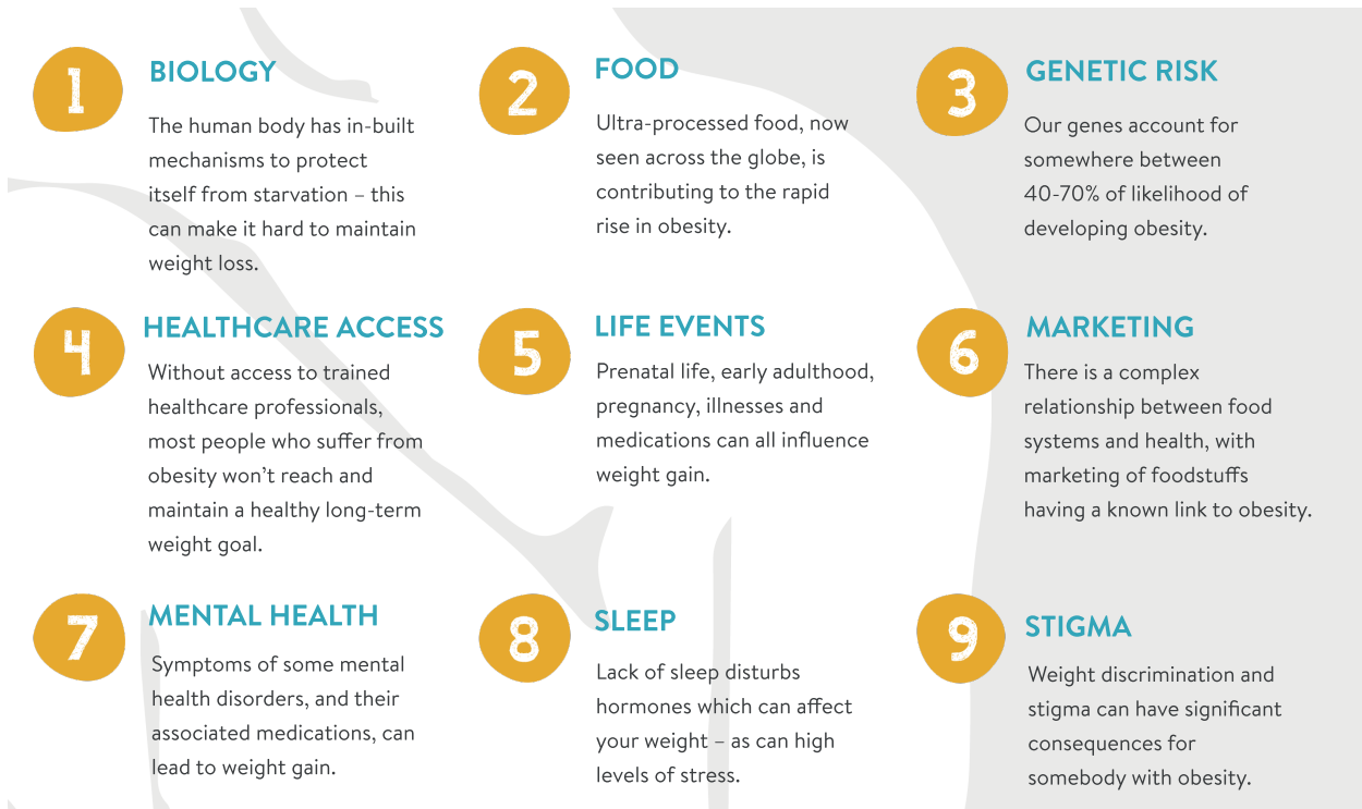
Figure 2. ROOTS of Obesity Fact Sheet. World Obesity Federation 2021 22