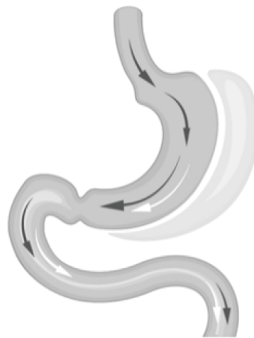
Figure 3. Gastric Sleeve

Gastric sleeve numbers have overtaken all other procedures as the most popular bariatric surgery worldwide. 9 The main reason for this lies with the simplicity and efficacy of the sleeve: reduction of meal portions without requiring any foreign body placement or diversion of food passage. The main problem with this procedure is the potential for narrowing or twisting of the gastric tube, obstructing food passage, and causing pain, reflux, and vomiting. Bleeding and leakage from the staple line have also been reported. Post-operative management following the sleeve procedure is simpler than after gastric bypass as there is no intestinal component to the surgery.