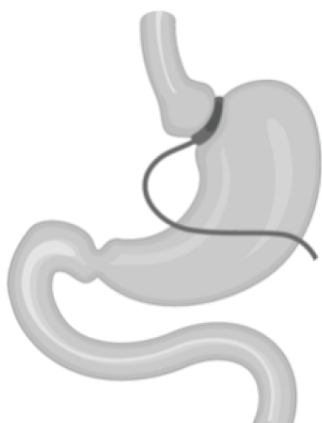
Figure 2. Gastric Band

In the past decade, gastric band insertions have plummeted worldwide. In Singapore, the lap band TM is not currently available, although there remains a sizeable minority of patients who have successfully lost weight and return to the clinic for band adjustments from time to time. The vast majority of gastric bands have been removed, with some patients electing to convert to a different bariatric procedure such as gastric bypass or sleeve to improve or maintain their weight loss. 7