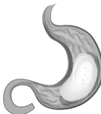
Figure 4. Gastric Balloon

First approved by the FDA in 1985, there are several types of gastric balloons available in Singapore today. The aim of the gastric balloon is to fill up the stomach and reduce hunger and cravings (refer to Figure 4 ). Gastric balloons are typically placed and removed by endoscopy and can be kept in the stomach for up to a year. The Spatz balloon is adjustable, so that an initial smaller volume can be placed to avoid nausea and cramps. Once the stomach is adapted to the balloon, it can be inflated further to occupy more space with the expectation of driving weight loss. Expected weight loss is in the range from 10–15 percent. 10